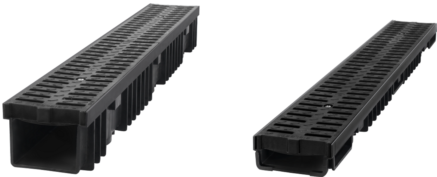
Technical sections of linear drain